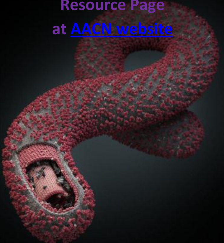
The Ebola virus.